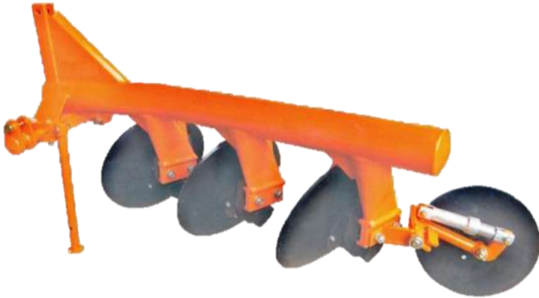
Fig. 1: View of a Disc Plow

A disc plow consists of a series of individually mounted, inclined disc blades on a frame supported by a furrow wheel. A tractor-mounted plow has a rear furrow wheel only. Disc plows are most suitable for conditions under which moldboard plows do not work sufficiently, such as in hard, dry soils, in sticky soils where a moldboard plow will not scour, and in loose, push-type soils such as peatlands.